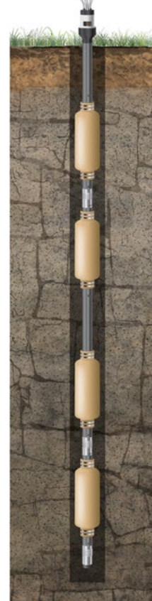
Up to 24 monitoring zones