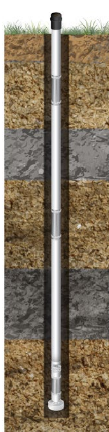
Up to 7 monitoring zones