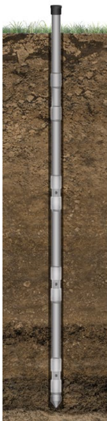
Up to 6 monitoring zones

Since the early 1980s, Solinst has been working with experts in the hydrogeology field to develop groundwater monitoring systems, which provide the high-resolution subsurface data that accurate subsurface investigations demand. Solinst manufactures three different types of multilevel systems, each suited to different environments and applications.